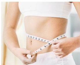
7 Day flat belly diet plan