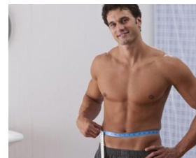
20 ways to gain weight fast